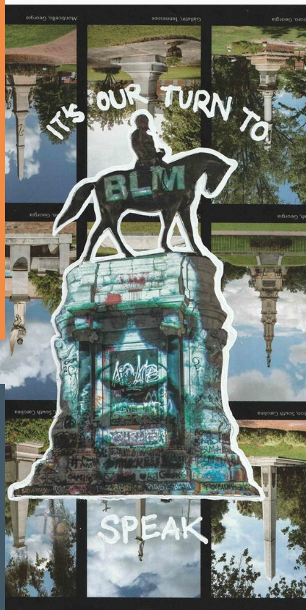
collage by cc4c alum: flintyfae

www.dawsoncollege.qc.ca/creative-collective-for-change