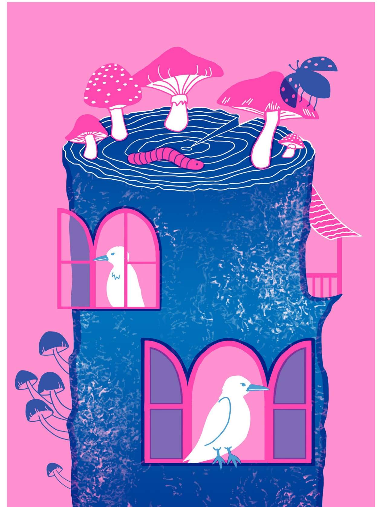
Standing nurse log (100 yr-old ash tree that died on campus last year) left on property to give life to woodpeckers, mushrooms and a host of insects.