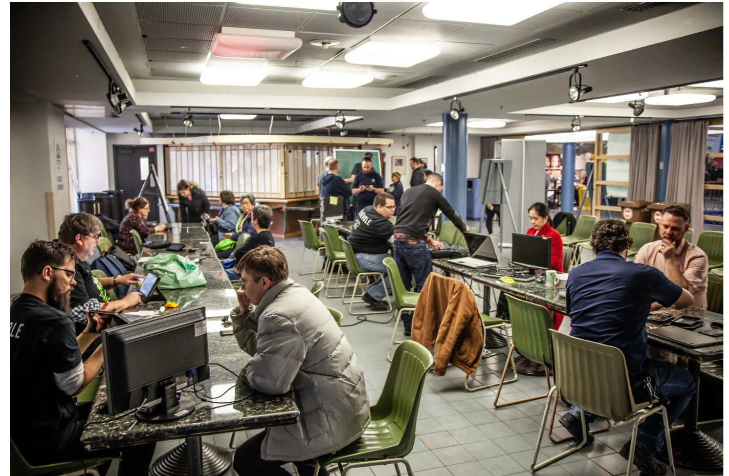
Facilities Management coordinates Dawson's first Repair Café, where computers, cell phones and bicycles were repaired free of charge.

✓ Accomplished Metric: Sustainable Forest Certified equivalent paper purchased