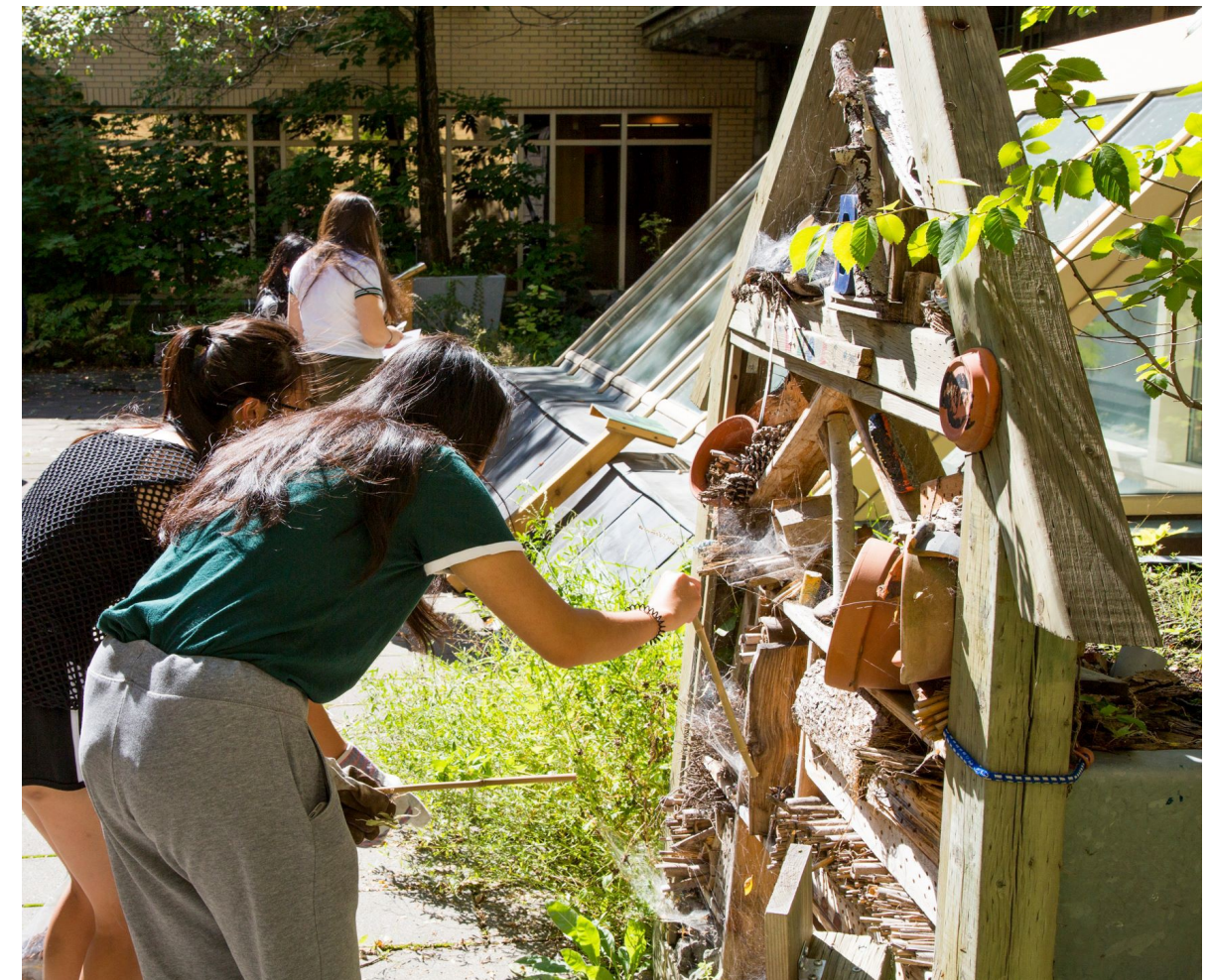
Students inventory the number of insect pollinators in the rooftop "Insect Resort."